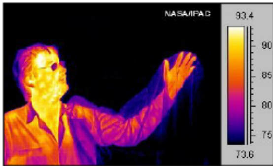
Night Vision & Heat Sensing