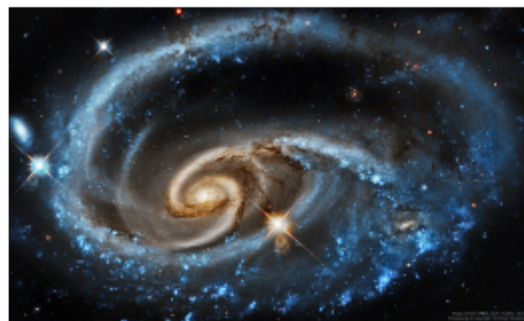
Studying complex structures in galaxies and nebulae

Wavelengths: 0.0010 cm to 0.1 cm Frequencies: 3 GHz to 400 THz