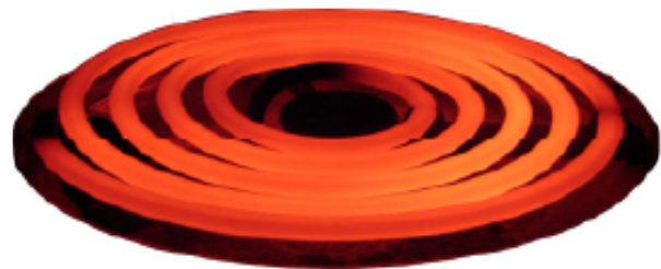
Cooking and Heating

Can be both Harmful and Beneficial! Harmful - too much can cause burns Helpful - night vision, cooking, scientific discovery